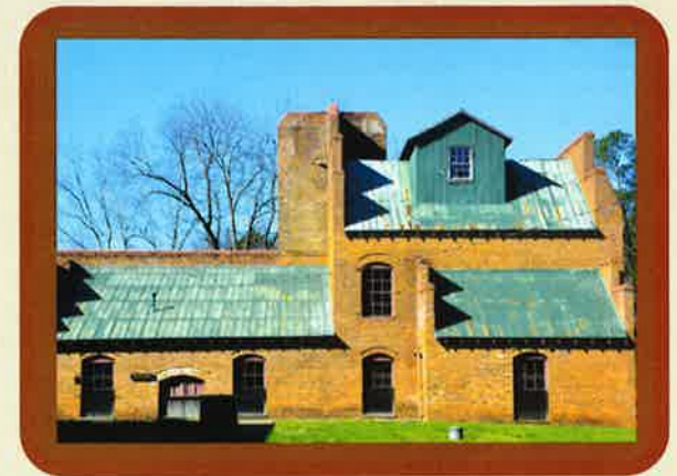
The Cotton Gin and the Grist Mill (pictured above) share a lovely grass area ideal for group gatherings.