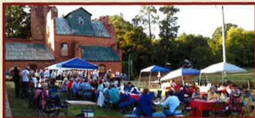
Wedding photos by Kendall Layne Photography

Schedule your event in a unique historical setting. Consider the Dorn Mill Complex for your next special occasion.