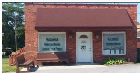
McCormick Helping Hands Food Pantry 211 South Main St., McCormick, SC 29835

McCormick Food Pantry P.O. Box 419 McCormick, SC 29835