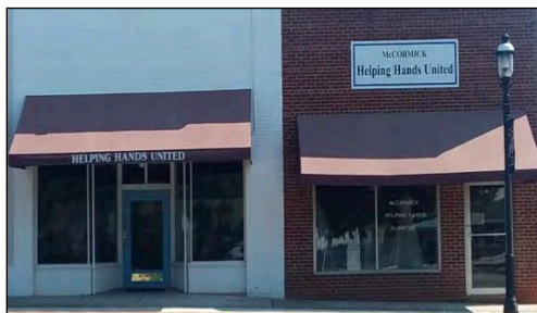
McCormick Helping Hands Thrift Store 112 N Main St., McCormick, SC 29835 (864) 852-2893

McCormick Helping Hands Thrift Store accepts clean clothes of all sizes, linens, small household items and novelties. Donations are accepted during open store hours. Come find good, clean clothes at a reasonable price. Funds generated from the store support the bulk of food purchases for the Food Pantry.