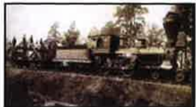
Railroad Crew-circa 1890

A number of interested, local residents and studies effected the current results beginning in the 1990's. Volunteers serve on the Board of Directors and others clear and maintain the trail on a monthly basis.